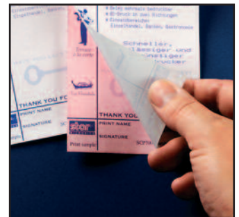
Original + 2 Copies